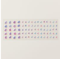
Flat Adhesive Backed Pearls [160449] $9.00