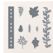
Notes Of Nature Dies