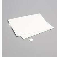
Stampin' Dimensionals [104430] $4.25