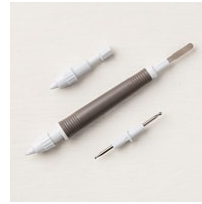
Take Your Pick [144107] $12.00