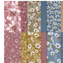
Wildly Flowering 12" X 12"