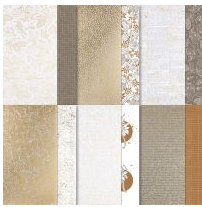
Nature's Sweetness 12" X 12" (30.5 X 30.5 Cm) Specialty Designer Series Paper [162616] $16.50