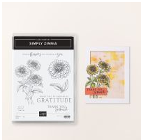
Simply Zinnia Cling Stamp