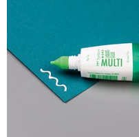
Multipurpose Liquid Glue [110755] $6.00