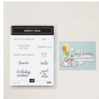
Simply Said Mix & Match