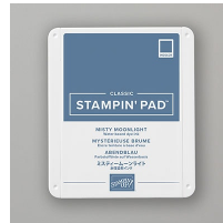
Misty Moonlight Classic