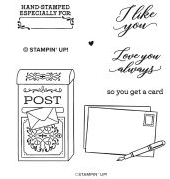
Stamped With Love Photopolymer Stamp Set (English) [161395] $20.00