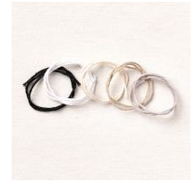
Baker's Twine Essentials Pack [155475] $11.00