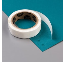
Mini Glue Dots [103683] $7.25