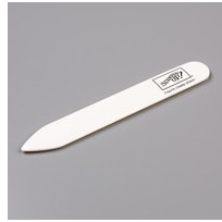
Bone Folder [102300] $8.00