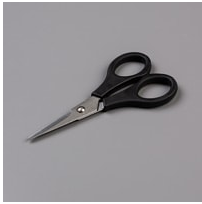
Paper Snips [103579] $12.00