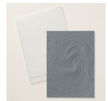
So Swirly Embossing Folder