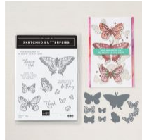
Sketched Butterflies Bundle