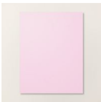
Bubble Bath 8 1/2" X 11"