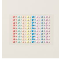
Rainbow Adhesive Backed