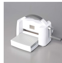
Stampin' Cut & Emboss Machine