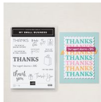
My Small Business Photopolymer Stamp Set (English)