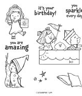
Kiddin' Around Cling Stamp Set (English)