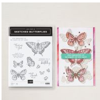
Sketched Butterflies Cling Stamp Set (English)