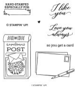
Stamped With Love