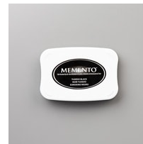
Tuxedo Black Memento Ink Pad