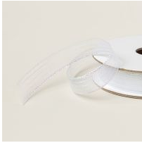
Iridescent 1/2" (1.3 Cm)