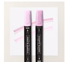
Bubble Bath Stampin' Blends Combo Pack