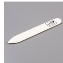
Bone Folder [102300] $8.00