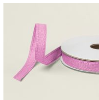
Petunia Pop 3/8" (1 Cm) Bordered Ribbon [163785] $7.50