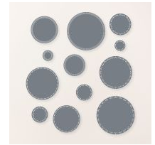
Spotlight On Nature Dies [163580] $35.00