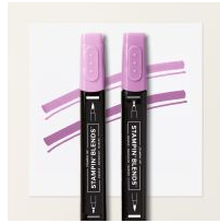
Petunia Pop Stampin' Blends Combo Pack [163828] $11.00