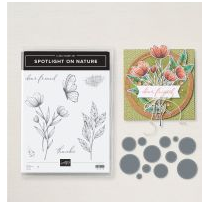
Spotlight On Nature Bundle [163581] $52.00