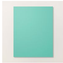
Summer Splash 8 1/2" X 11" Cardstock [163797] $11.50