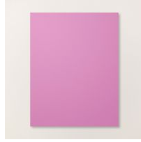
Petunia Pop 8 1/2" X 11" Cardstock [163801] $11.50