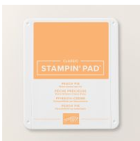
Peach Pie Classic Stampin' Pad [163810] $9.00