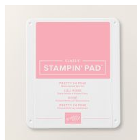
Pretty In Pink Classic Stampin' Pad [163807] $9.00