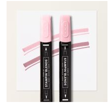
Pretty In Pink Stampin' Blends Combo Pack [163824] $11.00