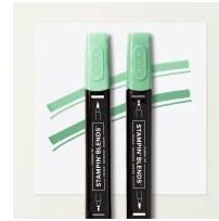
Shy Shamrock Stampin' Blends Combo Pack [163825] $11.00