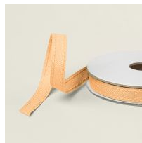
Peach Pie 3/8" (1 Cm) Bordered Ribbon [163783] $7.50