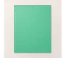
Shy Shamrock 8 1/2" X 11" Cardstock [163795] $11.50