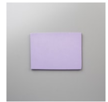
Simply Shammy [147042] $9.00