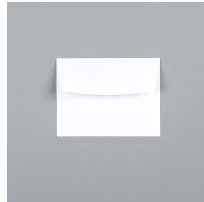
Basic White Medium Envelopes [159236] $11.00