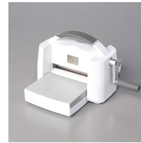
Stampin' Cut & Emboss Machine [149653] $130.00