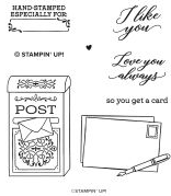
Stamped With Love Photopolymer Stamp Set (English) [161395] $20.00