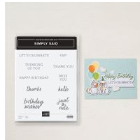
Simply Said Mix & Match Photopolymer Stamp Set (English) [163756] $17.00