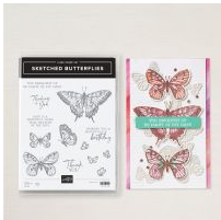
Sketched Butterflies Cling Stamp Set (English) [163490] $26.00