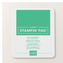
Shy Shamrock Classic Stampin' Pad [163808] $9.00