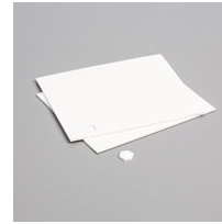
Stampin' Dimensionals [104430] $4.25