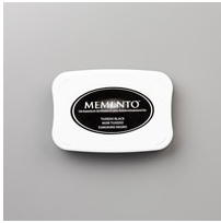
Tuxedo Black Memento Ink Pad [132708] $8.00