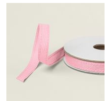
Pretty In Pink 3/8" (1 Cm) Bordered Ribbon [163784] $7.50