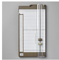
Paper Trimmer [152392] $28.00