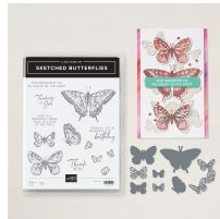
Sketched Butterflies Bundle (English) [163492] $49.50