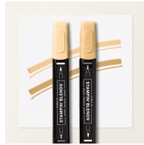
Peach Pie Stampin' Blends Combo Pack [163827] $11.00