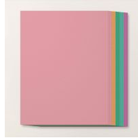
2024-2026 In Color™ 8 1/2" X 11" Cardstock [163803] $11.50