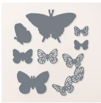
Sketched Butterflies Dies [163491] $29.00