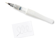
Clear Wink Of Stella Glitter Brush [141897] $9.00