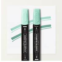
Summer Splash Stampin' Blends Combo Pack [163826] $11.00