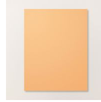
Peach Pie 8 1/2" X 11" Cardstock [163799] $11.50