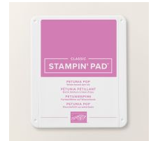
Petunia Pop Classic Stampin' Pad [163811] $9.00