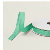
Shy Shamrock 3/8" (1 Cm) Bordered Ribbon [163787] $7.50