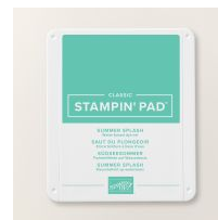
Summer Splash Classic Stampin' Pad [163809] $9.00