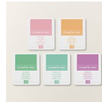
2024-2026 In Color™ Classic Stampin' Pads [165058] $40.50