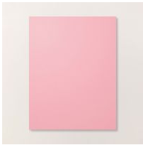
Pretty In Pink 8 1/2" X 11" Cardstock [163793] $11.50