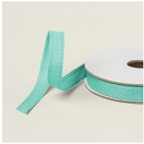
Summer Splash 3/8" (1 Cm) Bordered Ribbon [163786] $7.50