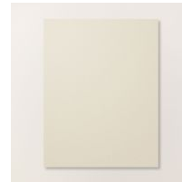
Basic Beige 8 1/2" X 11" Cardstock [164511] $11.50