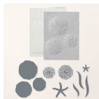
Seaside Wishes Hybrid Embossing Folder [163497] $33.00