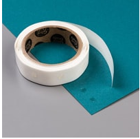
Mini Glue Dots [103683] $7.25