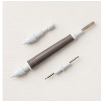
Take Your Pick [144107] $12.00