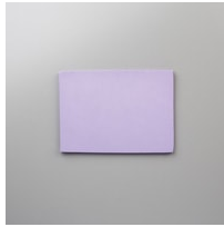
Simply Shammy [147042] $9.00