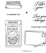
Stamped With Love Photopolymer Stamp Set (English) [161395] $20.00