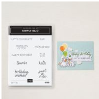
Simply Said Mix & Match Photopolymer Stamp Set (English) [163756] $17.00