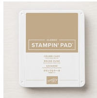
Crumb Cake Classic Stampin' Pad [147116] $9.00