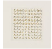
Iridescent Foil Gems [162842] $8.00