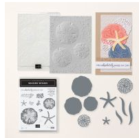
Seaside Wishes Bundle (English) [163498] $47.50