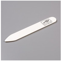
Bone Folder [102300] $8.00