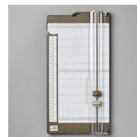
Paper Trimmer [152392] $28.00