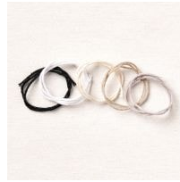
Baker's Twine Essentials Pack [155475] $11.00