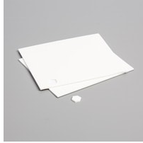
Stampin' Dimensionals [104430] $4.25