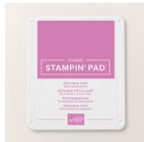
Petunia Pop Classic Stampin' Pad