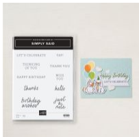
Simply Said Mix & Match Photopolymer Stamp Set