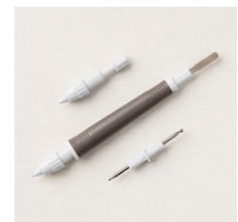
Take Your Pick