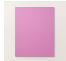
Petunia Pop 8 1/2" X 11"