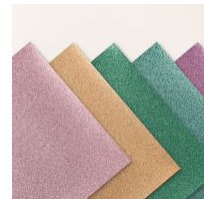
2024-2026 In Color™ Glimmer 12" X 12" (30.5 X 30.5 Cm) Specialty Paper