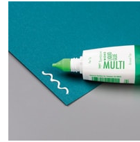
Multipurpose Liquid Glue