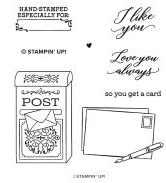
Stamped With Love