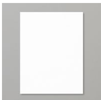
Basic White 8 1/2" X 11"