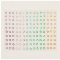
2024-2026 In Color™