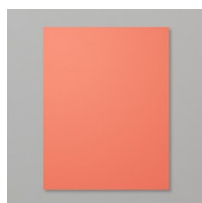
Calypso Coral 8-1/2" X 11"