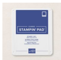
Starry Sky Classic Stampin' Pad