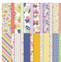
Butterfly Kisses 6" X 6" (15.2 X