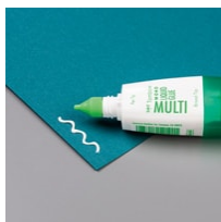
Multipurpose Liquid Glue