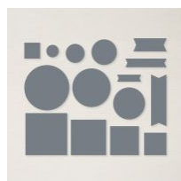
Stylish Shapes Dies