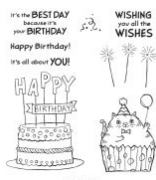
Best Day Cling Stamp Set