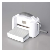
Stampin' Cut & Emboss