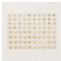
Brushed Brass Butterflies