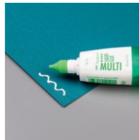
Multipurpose Liquid Glue [110755] $4.00