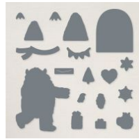
Yeti Dies [160253] $28.00