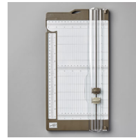
Paper Trimmer [152392] $25.00