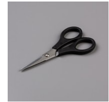
Paper Snips [103579] $11.00