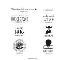
Limited Edition Cling Stamp Set (English) [158754] $19.00