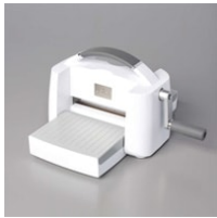
Stampin' Cut & Emboss Machine [149653] $125.00