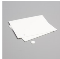
Stampin' Dimensionals [104430] $4.25