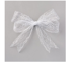
Metallic Mesh Ribbon [153550] $8.00