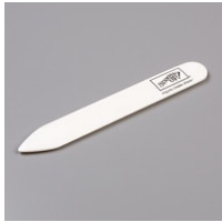
Bone Folder [102300] $7.00