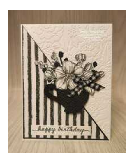
DSP = Designer Series Paper cs = cardstock