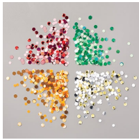
Sequins For Everything