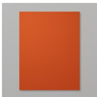
Cajun Craze 8-1/2" X 11"