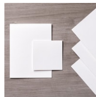
Whisper White 8-1/2" X 11"