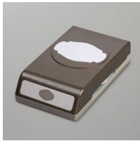
Story Label Punch