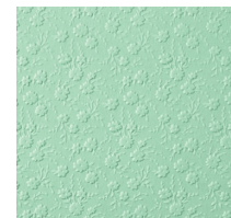
Ornate Floral 3D Embossing