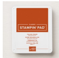
Cajun Craze Classic Stampin'