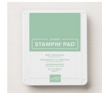
Mint Macaron Classic