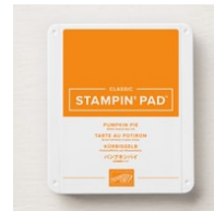
Pumpkin Pie Classic