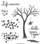
Life Is Beautiful